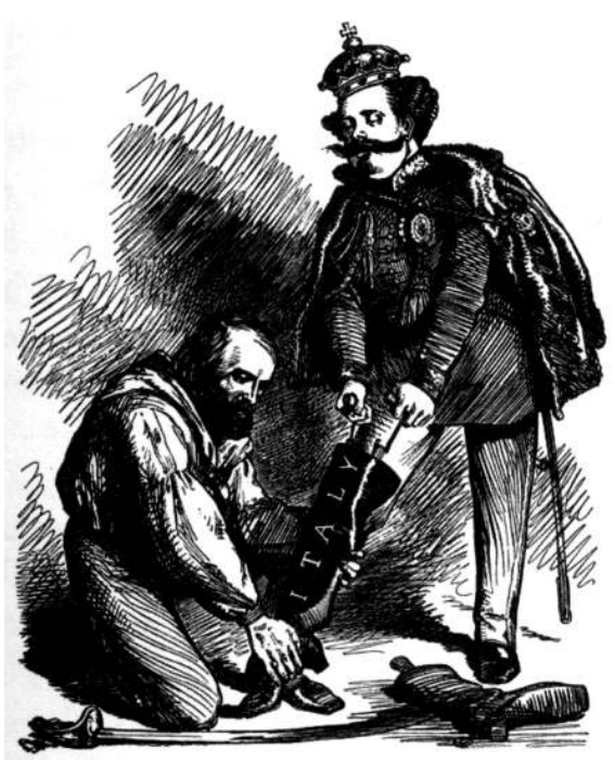
RIGHT LEG IN THE BOOT AT LAST.

"IF IT WON'T GO ON, SIRE, TRY A LITTLE MORE POWDER."