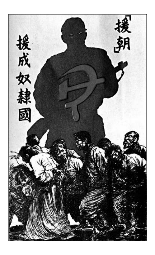
A South Korean poster from 1950 showing what the South Koreans feared would happen to their country.